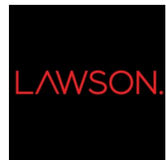
Property Management Team 02 4973 3111

With Bonnells Bay Shopping Centre just a 4 minute drive away, Bonnells Bay Public School a 2 minute drive, and the