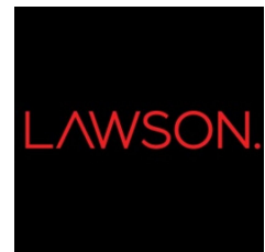
Property Management Team 02 4973 3111

Water usage and lawn maintenance included in the rent.